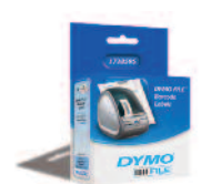
DYMO File™ Labels Roll of 450 labels Item # 1738595