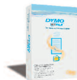
DYMO File™ Software Office Edition: Scan up to 5000 pages each month Item # 1738590