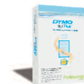
DYMO File™ Software Professional Edition: Unlimited scanning Item # 1738592